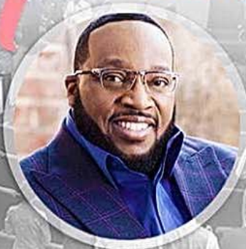
MAR. 2, 7PM BISHOP MARVIN SAPP

DAY SESSIONS SEMINARS, PRAISE & WORSHIP, CHOIRS, AND SPECIAL MUSICAL GUESTS